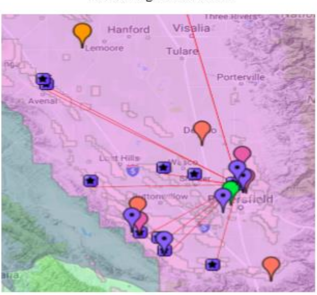
Largest stationary sources of PM2.5 pollution (purple markers represent oil and gas facilities) Source: CARB Pollution Mapping Tool (ver 1.1)

Source of underlying map: SJVUAPCD Draft 2017 Air Monitoring Network Plan