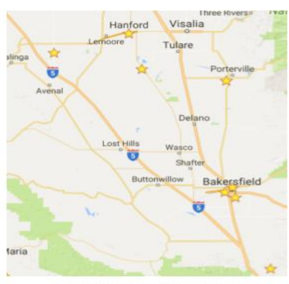
Location of PM2.5 Monitors