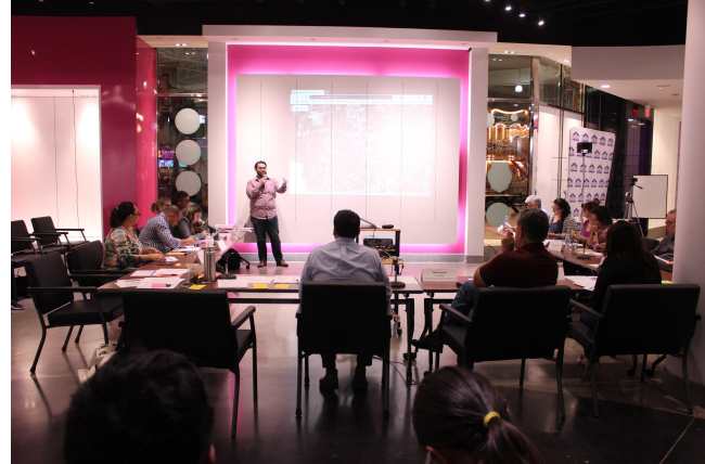
AB617 Steering Committee Meeting