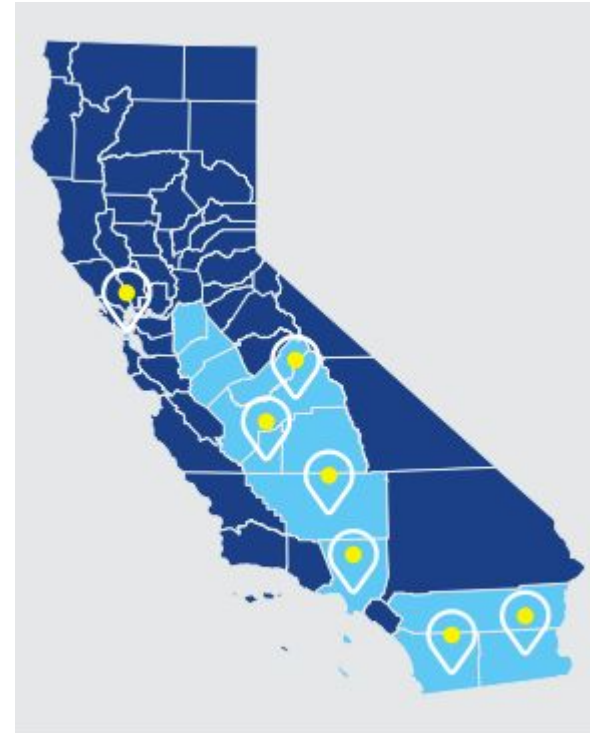
Regional IVAN presence by county and partner regions