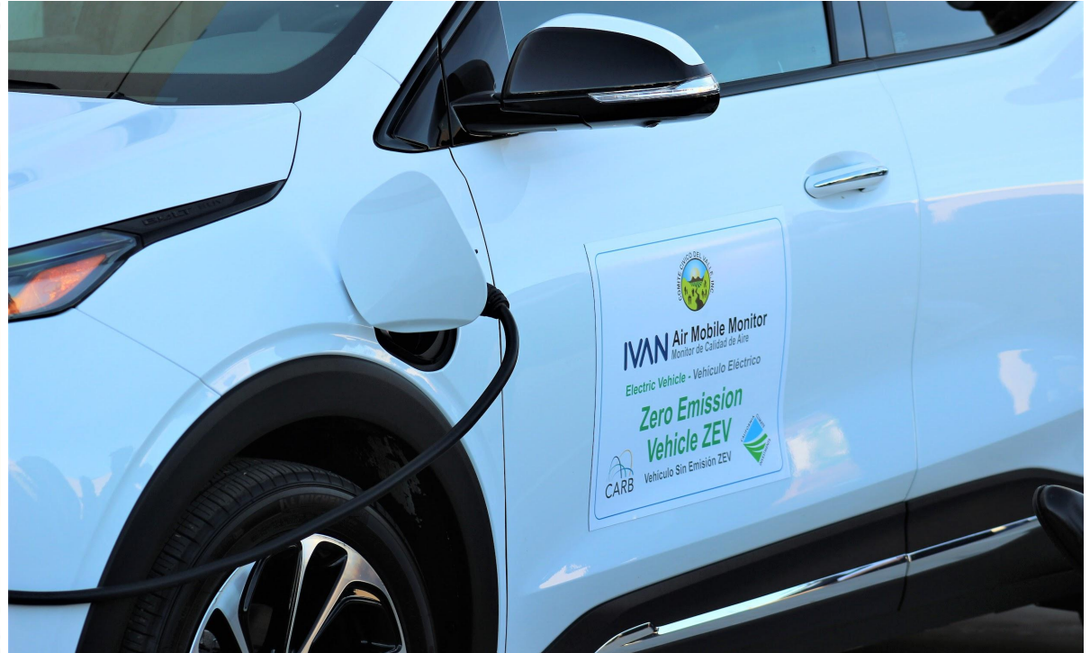
Mobile monitoring unit for the Imperial and Eastern Coachella Valley