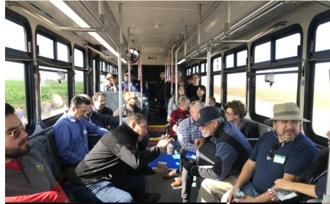
AB617 Community Tour

The IVAN Air network has various partners across California. The network supports partner organizations by providing training and a platform for environmental reports and to collect air quality data. Current partners operating in the network include Casa Familiar (San Ysidro), Coalition For A Safe Environment (Wilmington), the LEAP Institute (Huron), Central California Environmental Justice Network (San Joaquin Valley), and Greenaction (Bayview Hunters Point). Project partners of the IVAN network that provide support in quality control improvements and public health messaging include the Tracking California program.